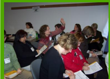
Clark County Leadership Academy participates in a poverty simulation