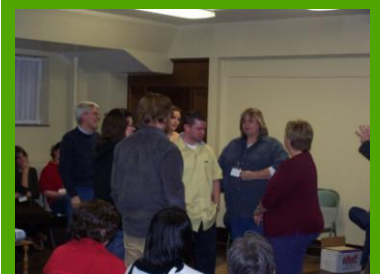
Clark County Circles Campaign (birthed out of the Bridges Out of Poverty movement) joins people together across class lines for the purpose of ending poverty.

For more information go to www.thinktank-inc.org or contact Marlo Fox at 937.727.9119